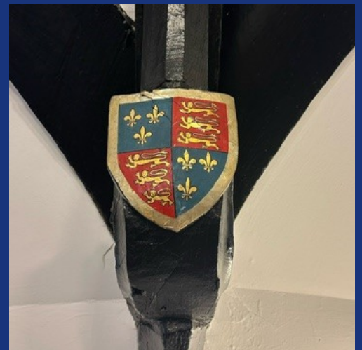
Armorial of the City of Salisbury

This is why this part of the Bradbeers store is a Grade II listed building.